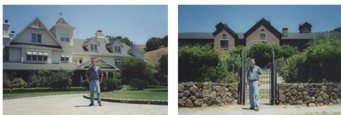
Clint Dantinne at Skywalker Ranch & Skywalker Sound