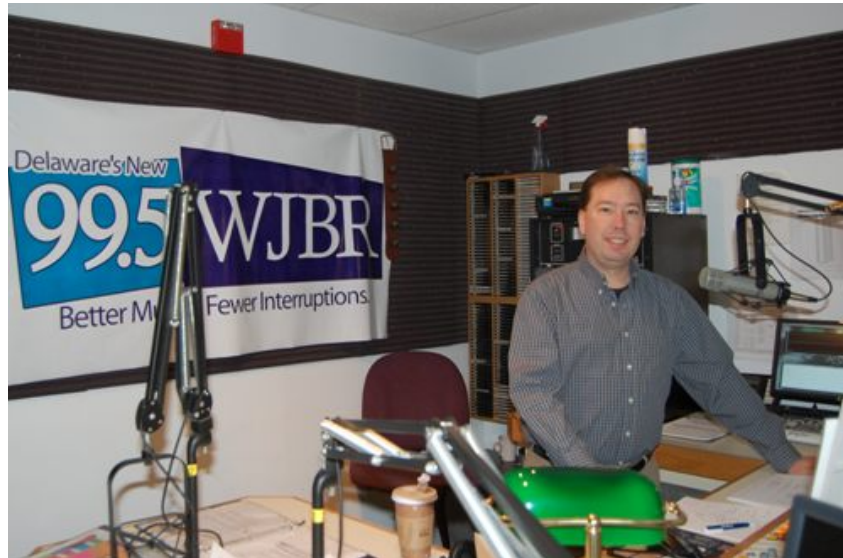
WJBR Control Room

Read his radio blog reminiscing of earlier WJBR memories. Click HERE