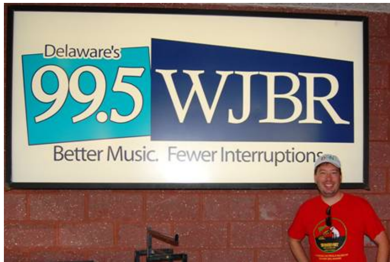
At Frawley Stadium while attending a Blue Rocks baseball game in August 2011